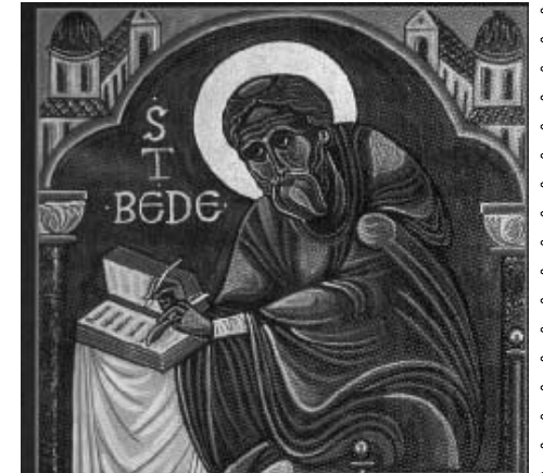
Saint Bede, called "The Venerable"

Do you study history at school? Do you learn about the presidents or about the founding of our country? Or about battles and soldiers from long ago? All of those things are important, and sometimes exciting! But did you know we have a lot to learn about our history of our Church, too?