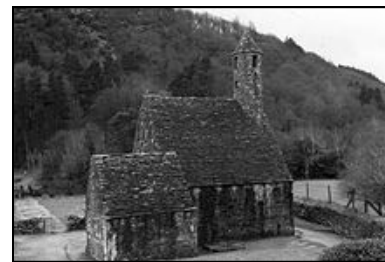
The little chapel of Saint Kevin, in Glendalough, Ireland today

St. Kevin started a monastery in an area in Ireland called Glendalough. Many, many people wanted to learn from Saint Kevin, and they became monks at this monastery. If you visit Ireland someday, you can even see where the monastery was!